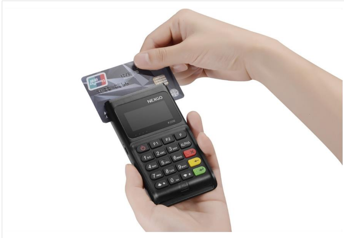
Magnetic Strip Cards